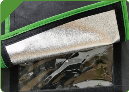
• Inspection window.