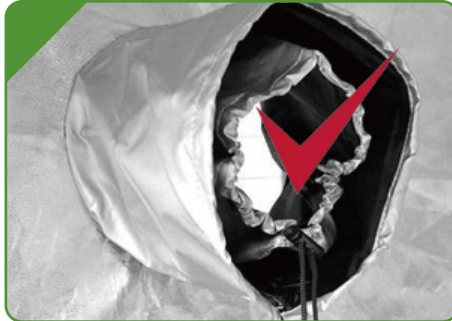
• Dual-layer ventilation opening.