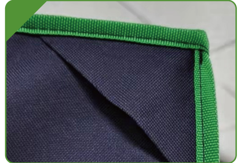
• Corner reinforcements.